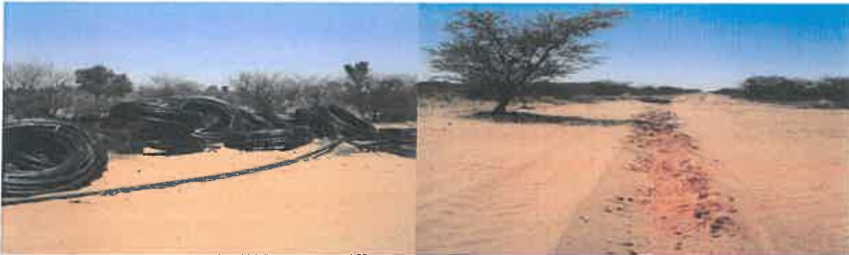
Figures: Above are the water pipes to be installed for the stock water system.

Heuningsvlei Morafe Range stock water project – the budget for the project is R4 306 020.00. This is the second phase of the Heuningsvlei bulk water project. It is anticipated that the project will be completed by end of March 2016. The contractor has already cleared the area next to the road where they are working. About 5.5 km of the water pipeline installed thus far.