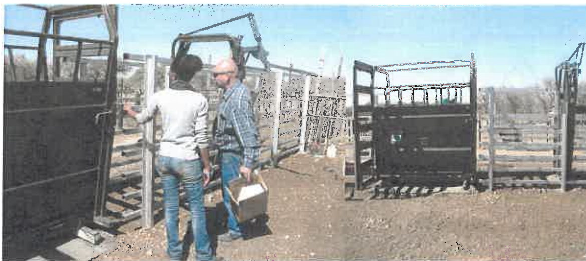
Inspection of stock handling facilities at Sol Plaatje Commonage Farm