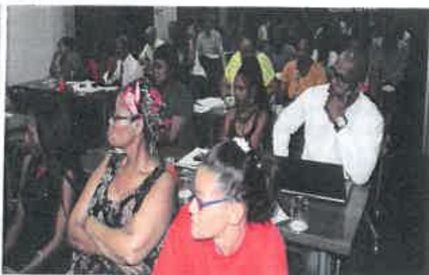
Members involved in Disaster Management