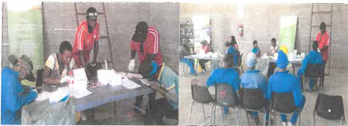
FIG 1 AND 2 : Counselling and Testing in session