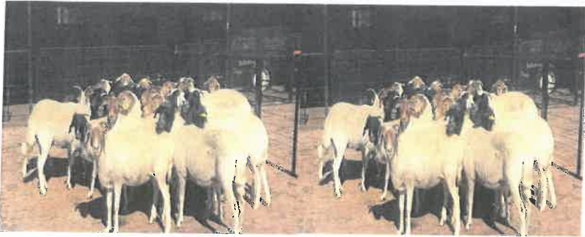
Some of the Namakwa Afrikaner sheep received by small holder farmers at John Taolo Gaetsewe