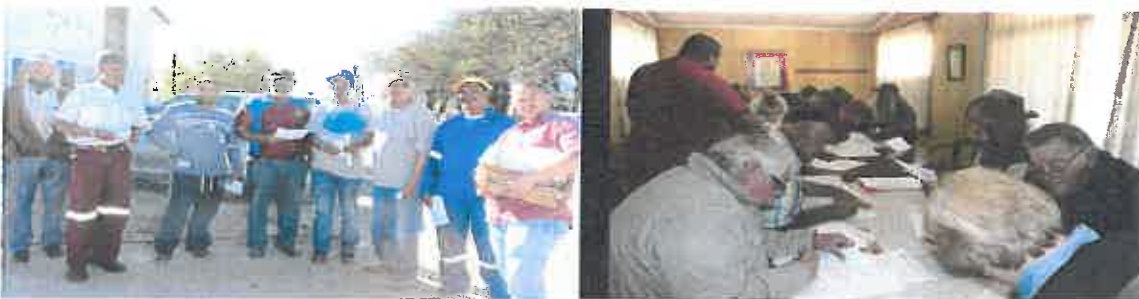
Emerging and Commercial farmers receiving drought assistance – Loeriesfontein

Due to the critical nature of the drought situation, Hantam Local municipality was again re-declared on the 31 March 2015 as per council resolution nr: URN07/03/2015. A report was written and the department has approved and made available a total amount of R7 717 080 for Loeriesfontein/Brandvlei and Caivina areas in Namakwa District. Implementation period for the procurement of fodder started from 1 st of October until end November 2015. A total of 257 farmers were assisted in this scheme.