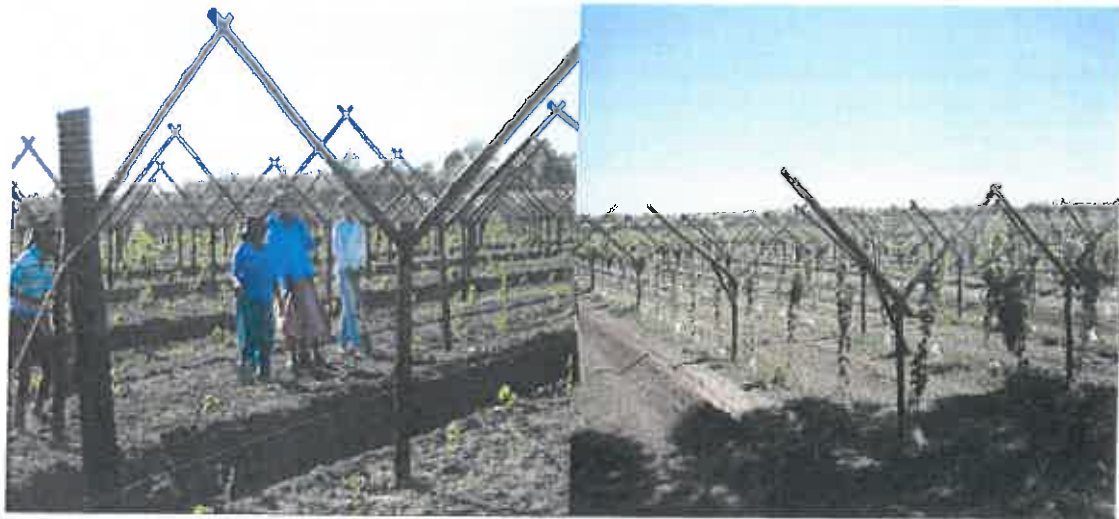
Vineyard development at Blucoso & Eksteenskui