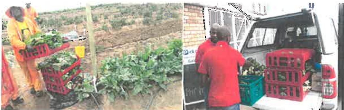
FIGURE 1: SPINACH HARVESTED FOR THE MARKET

Reikemetse Cooperative in Smichtsdrift was linked with Pick n Pay Galeshewe, Kimberley. The project managed to supply the store with 153 bundles of spinach for R5 each during December 2015.