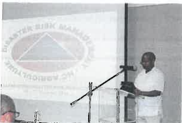
MEC giving key note address

On 26 and 27 October 2015 the department celebrated International Day for Disaster Risk Reduction in Upington. The International Day for Disaster Reduction (IDDR) is a day to celebrate how people and communities are reducing their risk to disasters and raising awareness about the importance of Disaster Risk Reduction (DRR).