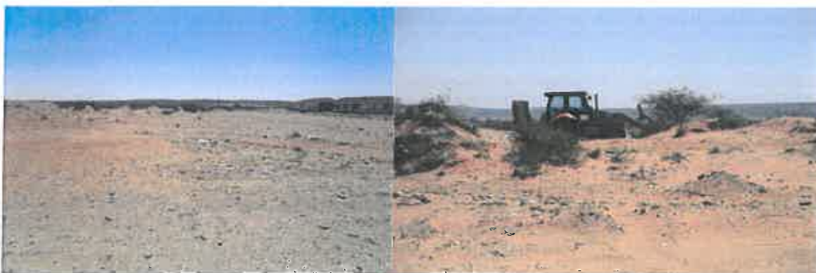
Figure: Above is a site for the construction of the Clinic – contractor busy clearing the area

The project is funded by Independent Development Trust (IDT) through Department of Health with a total budget of R15 million. It started on the 1st of October 2015 and is anticipated to be completed by the end of November 2016.