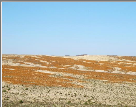
Namib lichen fields outside Alexander bay

Drivers of habitat loss: The advanced threats status of these ecosystems are due to their small sizes, the rate of habitat loss and limited intact habitat left. Habitat loss in the Bokkeveld region is primarily due to Rooibos tea cultivation and other agricultural lands and in the northern coastal region due to mining activity.