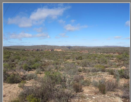
Renosterveld vegetation of the Bokkeveld

Implications for development: The National Environment: Biodiversity Act (No. 10 of 2004) makes provision for the listing of ecosystems that are threatened and in need of protection. The status of ecosystems are considered in environmental authorisation reviews to ensure that ecosystems and their functionality is maintained. Representative areas of Ecosystems must be protected and development must not push ecosystems into higher threat status categories. It is worth noting that the Northern Cape's draft Red Data Listed ecosystems are already in the highest threat status category.