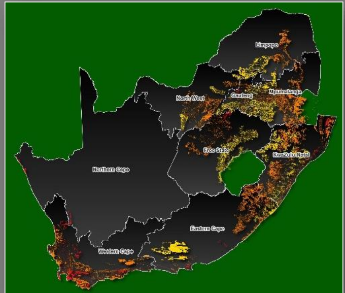
South Africa’s Draft Red Listed Ecosystems (2021)

The Northern Cape Province has a number of land-based threatened ecosystems that are contained in the draft Red List of Ecosystems for South Africa (2021). This list was compiled to supplement the 2018 National Biodiversity Assessment and replace the previous 2011 Red List. The criteria used is that of the IUCN Red Listed Ecosystems Framework which is the current standard in global evaluations.